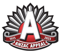
ANZAC APPEAL LOGO

Clubs will need to be able to demonstrate to the League that it has approval for use of any Department of Defence emblems when submitting designs for approval.