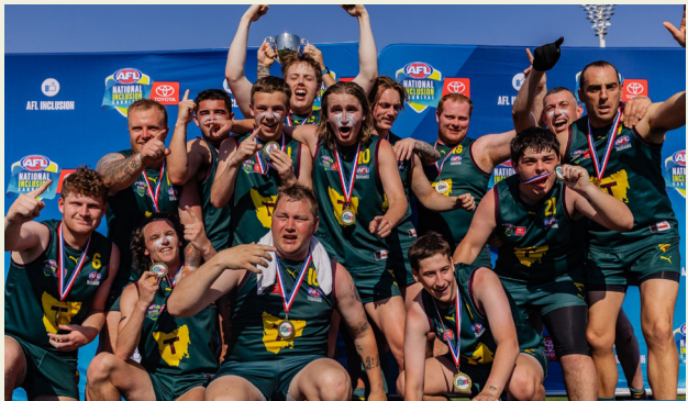
Division 1: Tasmania (34) defeated South Australia (30)