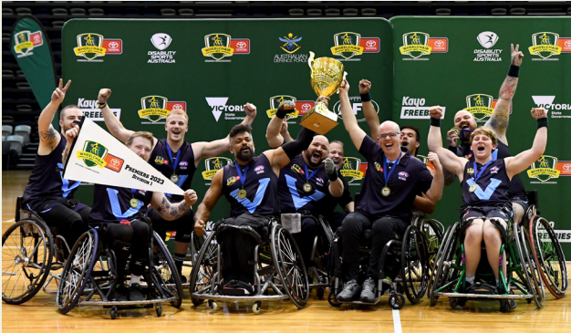
Division 1: Victoria- Metro (109) defeated Western Australia (52)