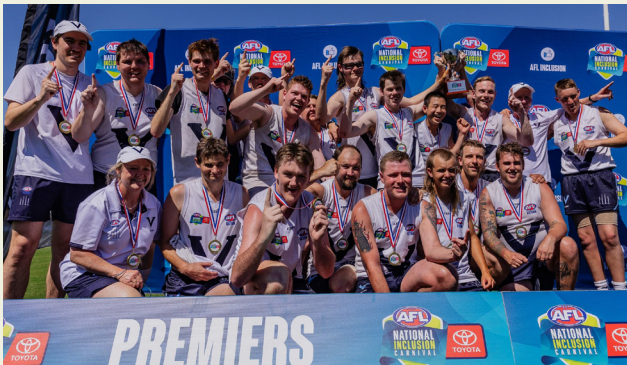
Division 2: Victoria- Country (58) defeated Queensland (25)