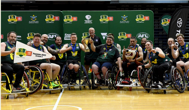
Division 2: Tasmania (82) defeated NSW/ACT (49)