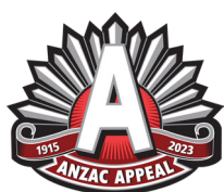
ANZAC APPEAL LOGO

Clubs will need to be able to demonstrate to the League that it has approval for use of any Department of Defence emblems when submitting designs for approval.