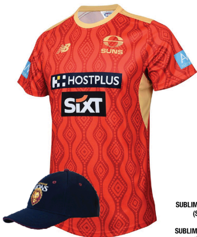
SUBLIMATED T-SHIRT & CAP (STOCK COLOUR) OR SUBLIMATED SINGLET & CAP (STOCK COLOUR)

ORDER BY 31 OCTOBER TO RECEIVE 2025 PRICING + 10% OFF! COMBO OFFERS: