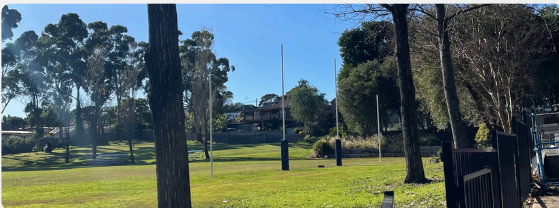
Canterbury Boys High School, Inner West Council