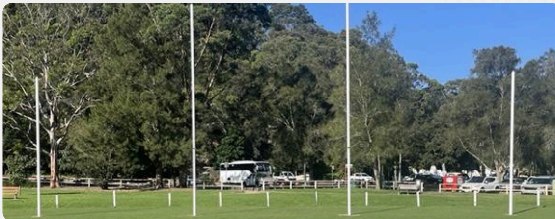
Tunks Park, North Sydney Council

Where existing fields have little or no AFL activity (including rectangle fields) posts enhance the field and make it more suited for AFL content. This is part of a wider plan to increase AFL content in the area.