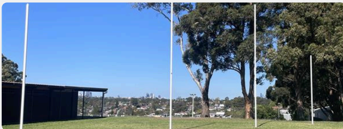
Holy Cross College, City of Ryde Council

Posts can be installed in school sites where it can be justified that it will result in a good community outcome. This could be a school engaged in AFL activity and/or an opportunity for the AFL community to use the school space casually or through a licence. This may also be part of a broader 'Breaking New Ground' initiative if lights are required to get the best outcome for the use.